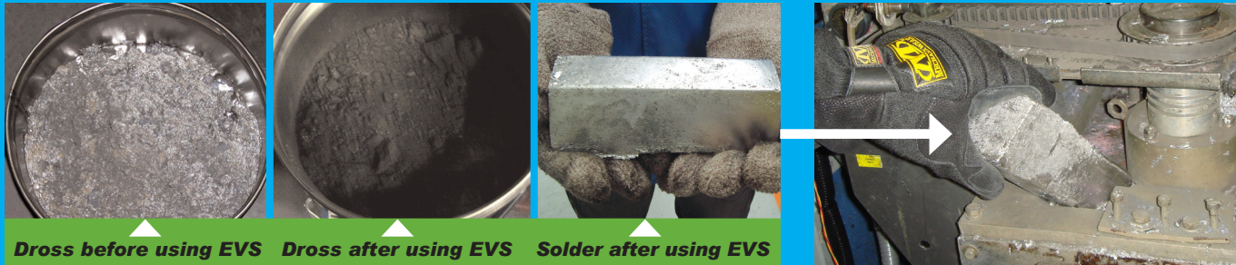
Dross before using EVS Dross after using EVS Solder after using EVS

SUPPORT: EVS International supports its product through 24-hour availability of spares and service and by partnering with quality distributors who all have TRAINED TECHNICIANS AND COMPREHENSIVE SPARES stockholding.