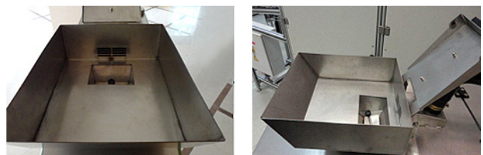
New loading tray increases the size of the loading area.