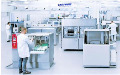
Machine Test Center